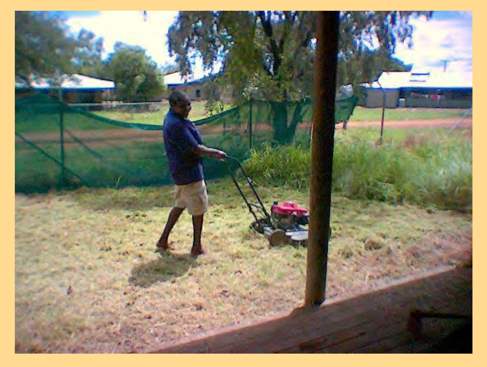
Cultural Mapping © 2010