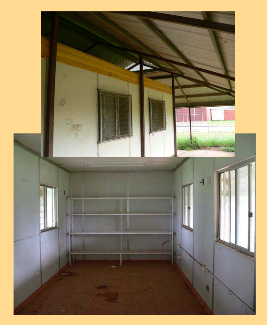
Cultural Mapping © 2010