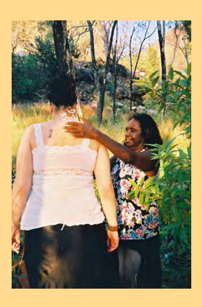
Cultural Mapping © 2010